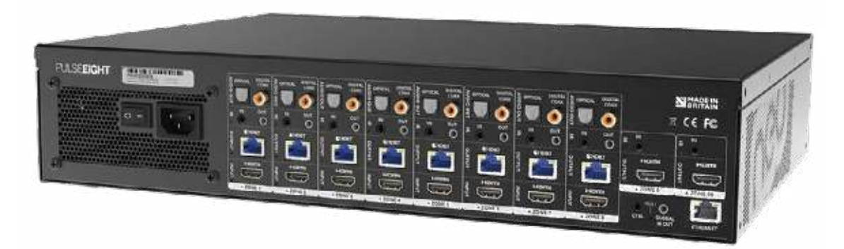
Figure 1 The combination of 18G backplane and zoned HDMI outputs can enable the use of HDBaseT version 3.0 extenders to the highest performance displays for 4K/60 HDR and gaming

Alternatively, Jonathan at Pulse Eight points out that there is an upsell opportunity on the entire system when the correct hardware is in place. For example, a high-end matrix switch with the aforementioned 18G crosspoint speed means that all zones can be integrated through the same switch: the installer may use zoned 18G HDMI outputs for the primary display and AV receiver to enable 4K/60 Dolby Vision and gaming content with immersive audio, while all other displays in the home are delivered content via HDBaseT links, either full capabilities with HDBaseT 3.0 or up to 4K/30 HDR with HDBaseT version 1.0/2.0.